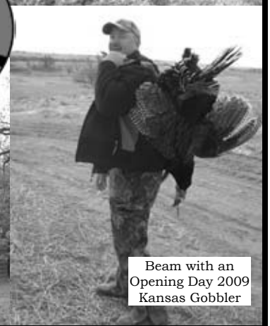
Beam with an Opening Day 2009 Kansas Gobbler